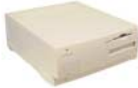
PowerMac G3 Beige Desktop