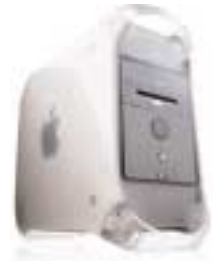
PowerMac G4 (PCI Graphics)