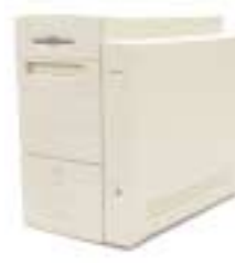
PowerMac G3 Beige Tower