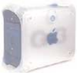
PowerMac G3 B&W