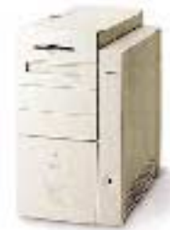
PowerMac 8600, 9600 and WGS series