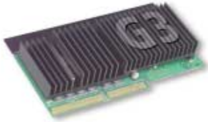
All-in-one G3 upgrade card