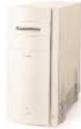
PowerMac 8500, 8550, 9500, 9550